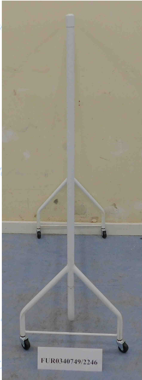
Picture 2: End view of the '44417 – White Heavy Duty Clothes Rails – L 4ft x H 5ft'